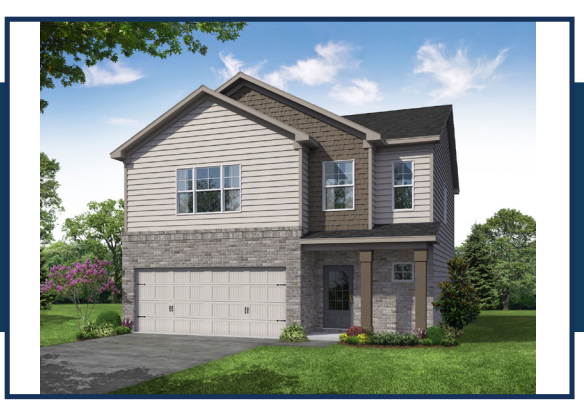
3 Bedrooms 2.5 Bathrooms 2-Car Garage